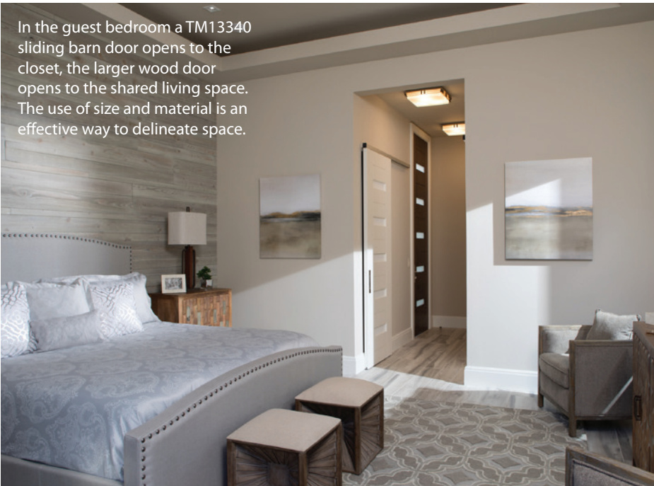
In the guest bedroom a TM13340 sliding barn door opens to the closet, the larger wood door opens to the shared living space. The use of size and material is an effective way to delineate space.

TM13340 doors continue to serve as a cohesive design element in the private and lesser used spaces on the first floor. The size of the doors has been scaled down to a more intimate 8' height and the construction switched to more economical paint-grade MDF.