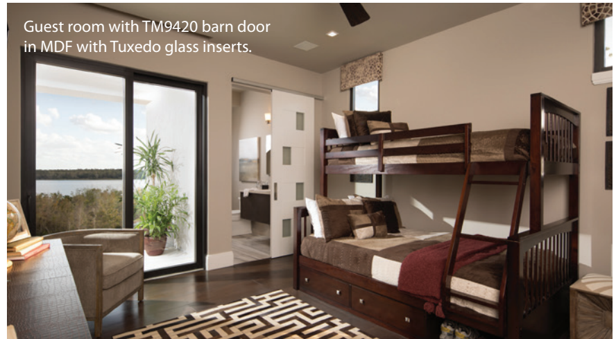
Guest room with TM9420 barn door in MDF with Tuxedo glass inserts.

The second level of the home uses a variety of door styles from the Tru&Modern collection in paint-grade MDF. The similarity between the door styles maintains a cohesive overall design while a variety of material inserts give each space its own unique feel.