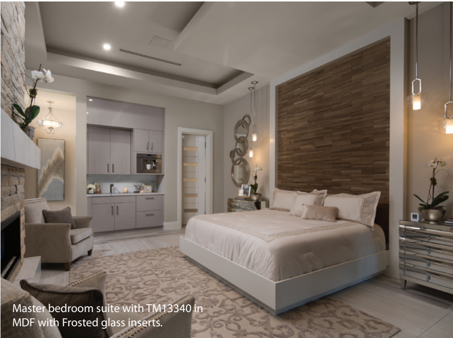
Master bedroom suite with TM13340 in MDF with Frosted glass inserts.