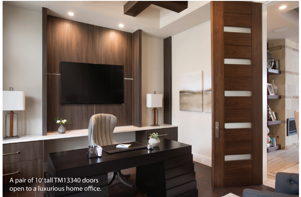
A pair of 10' tall TM13340 doors open to a luxurious home office.