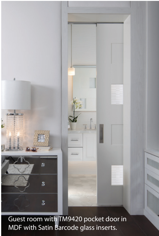
Guest room with TM9420 pocket door in MDF with Satin Barcode glass inserts.