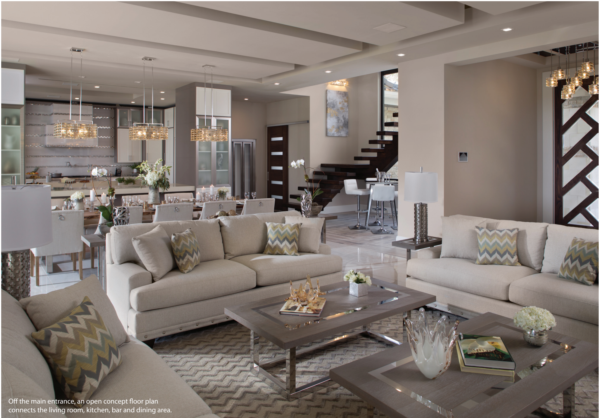
Off the main entrance, an open concept floor plan connects the living room, kitchen, bar and dining area.