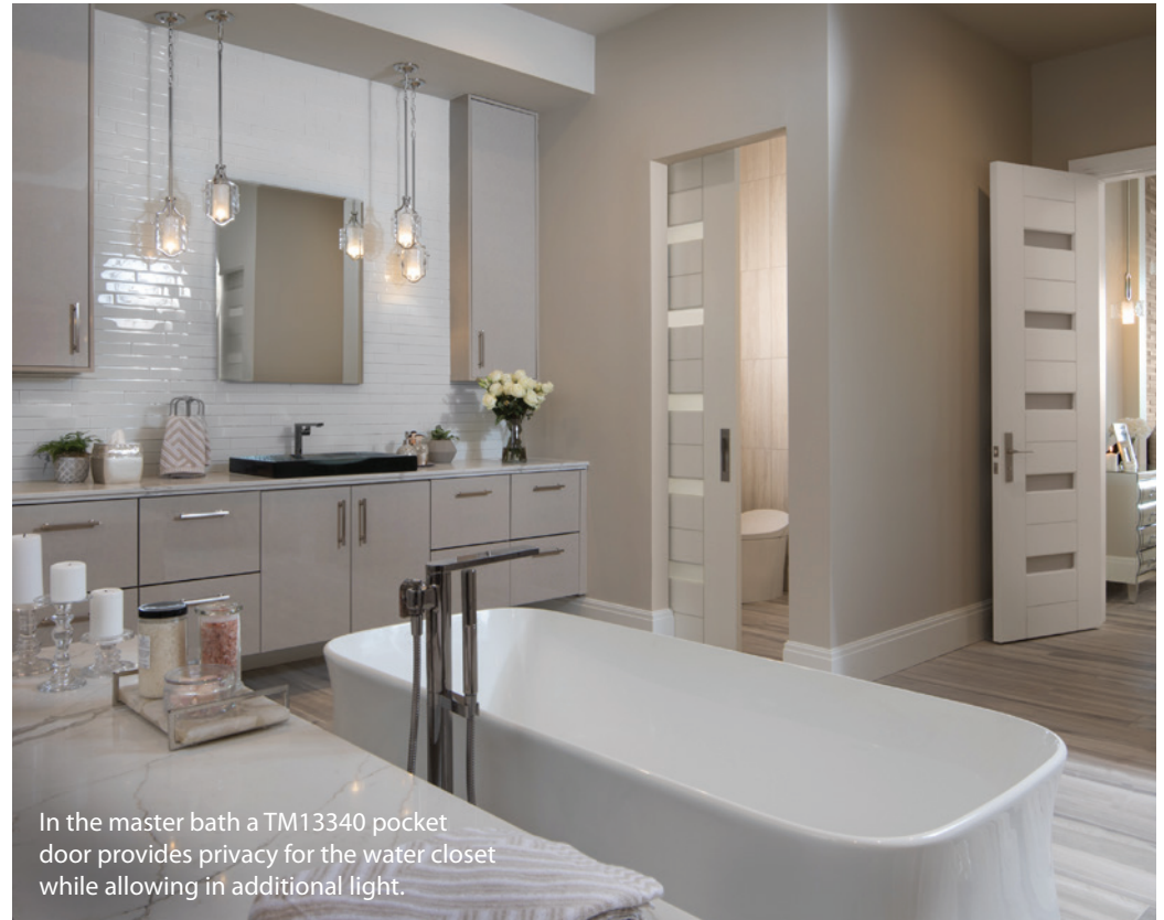
In the master bath a TM13340 pocket sliding barn door provides privacy for the water closet while allowing in additional light.