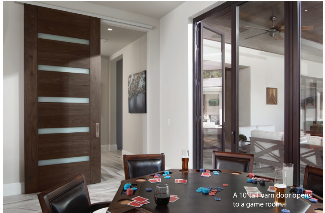
A 10' tall barn door opens to a game room.

An impressive pair of 10' tall doors open to the home office, a matching divider is featured in the powder room, and a stunning 10' tall barn door slides to reveal the game room.