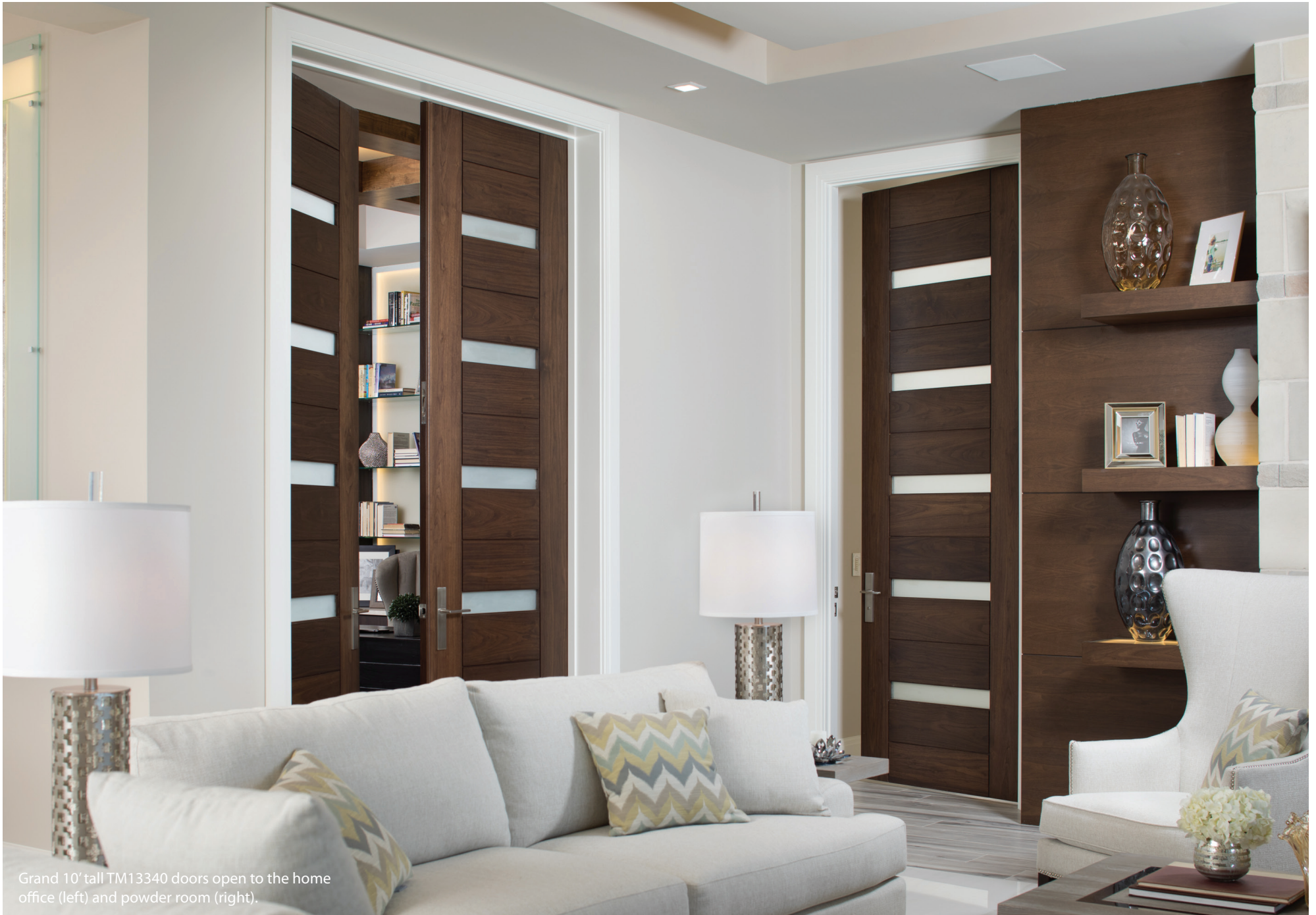
Grand 10' tall TM13340 doors open to the home office (left) and powder room (right).