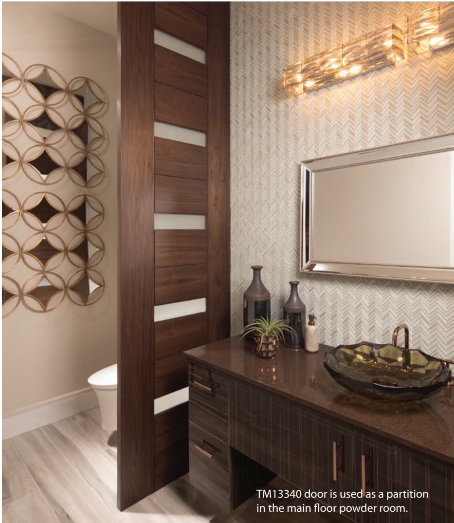
TM13340 door is used as a partition in the main floor powder room.