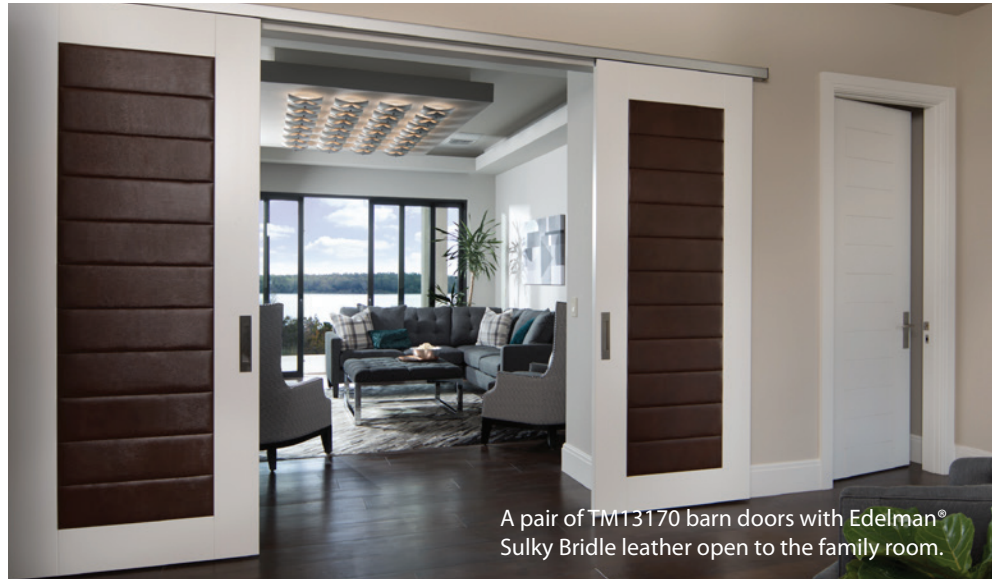
A pair of TM13170 barn doors with Edelman ® Sulky Bridle leather open to the family room.