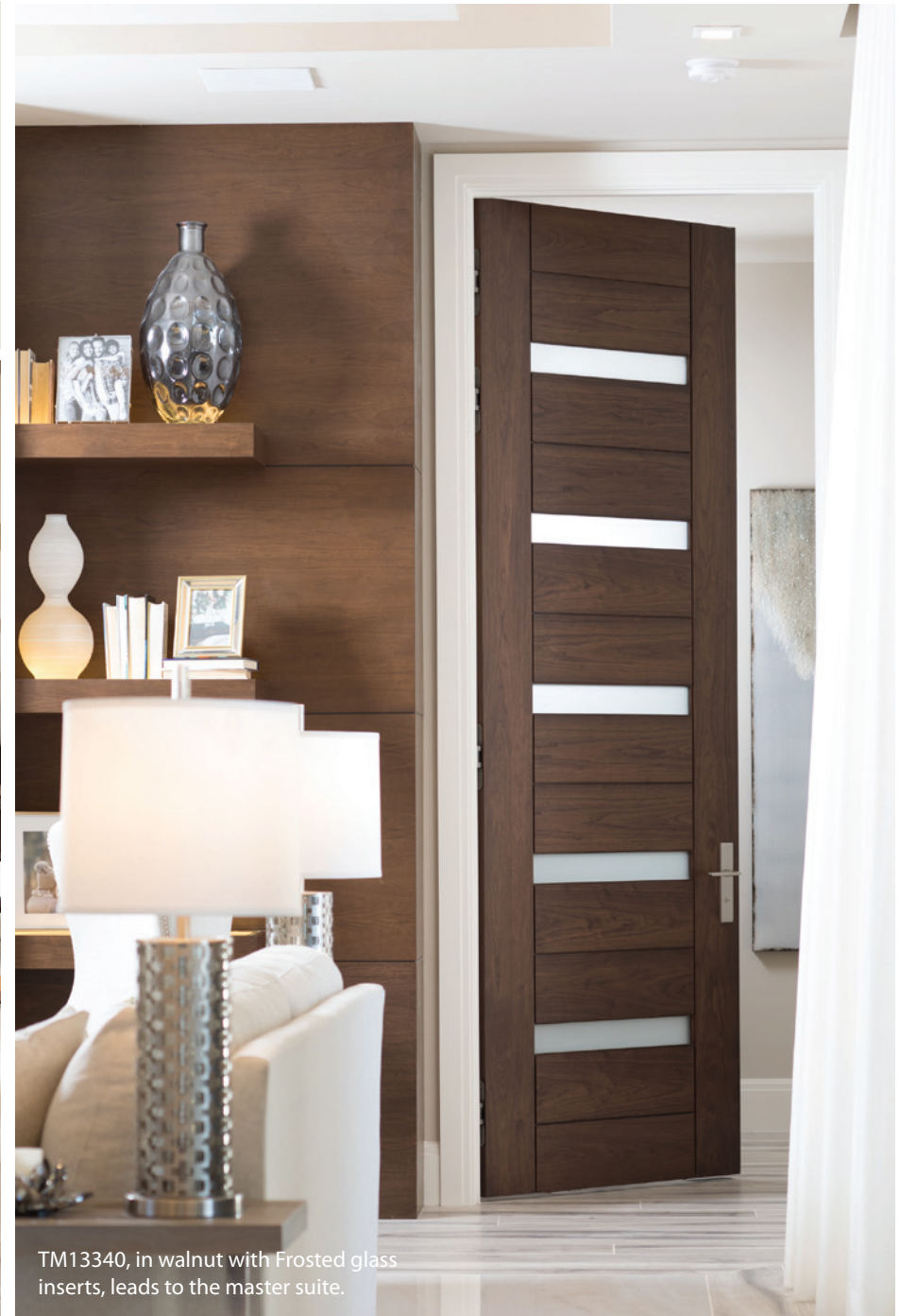
TM13340, in walnut with Frosted glass inserts, leads to the master suite.