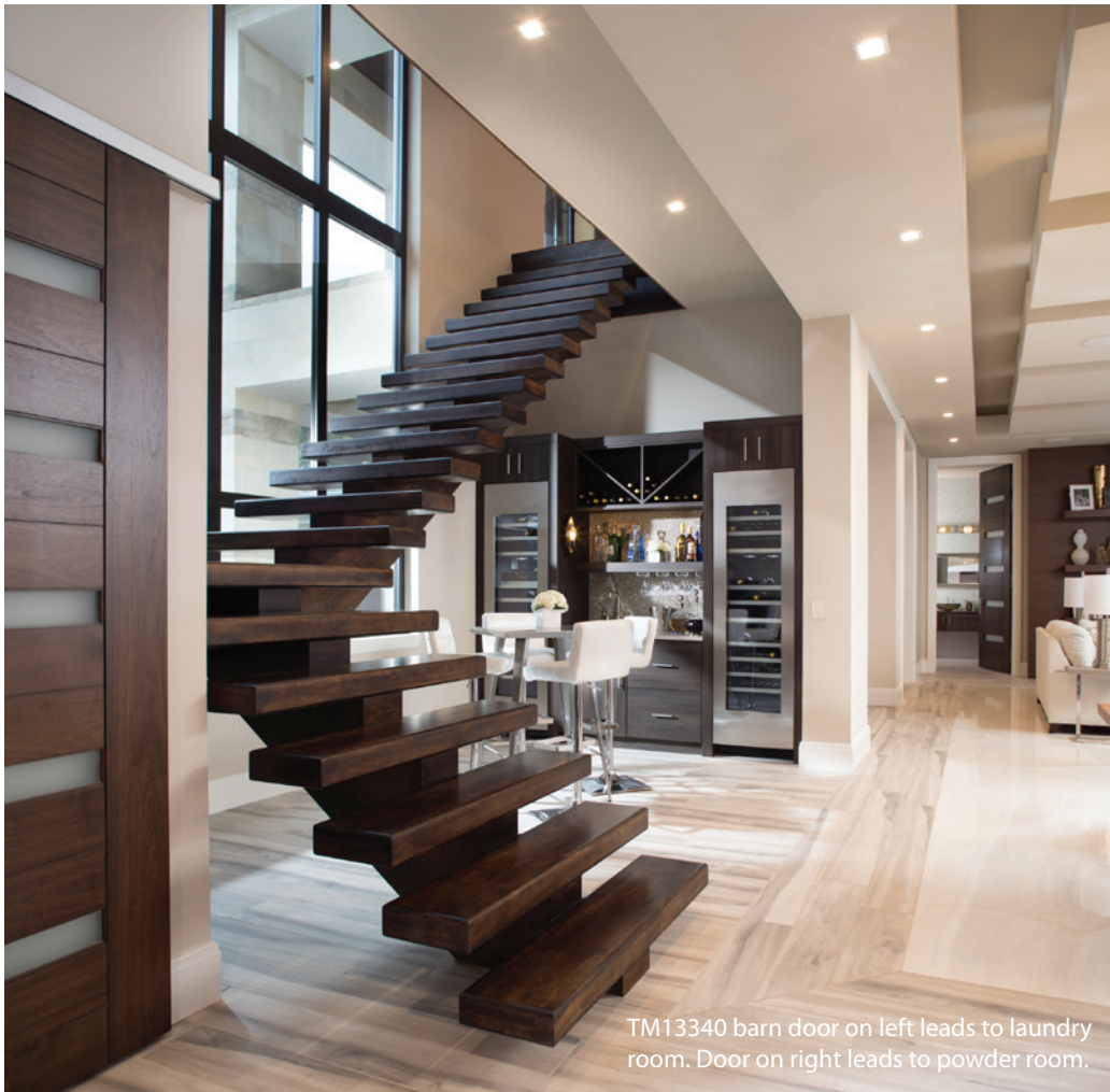
TM13340 barn door on left leads to laundry room. Door on right leads to powder room.

TruStile's Tru&Modern TM13340, in walnut with a Cappuccino finish and Frosted glass inserts, is used in a variety of applications for all the rooms adjacent to the main entryway on the first floor.