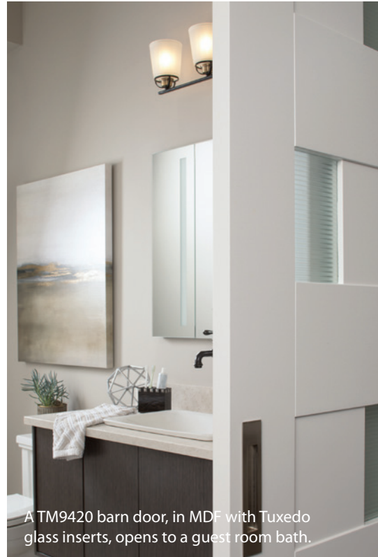
A TM9420 barn door, in MDF with Tuxedo glass inserts, opens to a guest room bath.

The second level of the home uses a variety of door styles from the Tru&Modern collection in paint-grade MDF. The similarity between the door styles maintains a cohesive overall design while a variety of material inserts give each space its own unique feel.